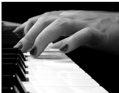
challenge (basic): Live Music score: 6.323 – place: 20/202