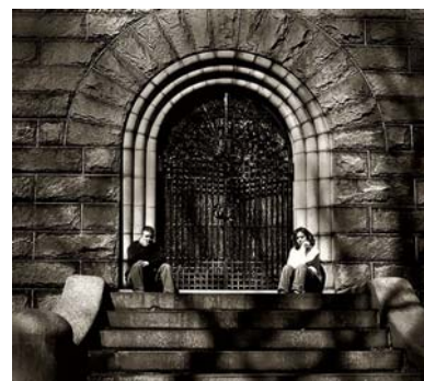
challenge: Cemetery score: 5.343 - place: 117/280