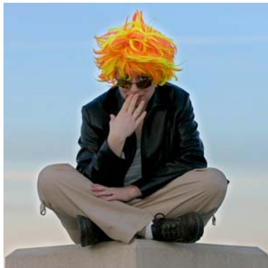
challenge: Yellow 3 score: 5.560 – place: 132/403

One my easier shots to do. I love it when a plan actually works. She’s laying on a reflector which helped a lot.