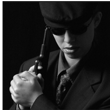
challenge: DPC Cinema score: 5.627 - place: 90/200

Five point five?!? It’s not stunning work, but I thought I’d at least see a low 6.