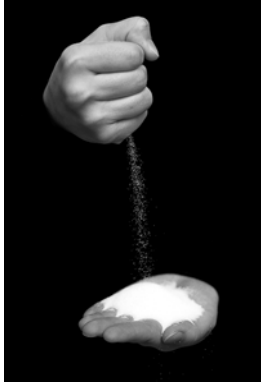
challenge (basic): Hands score: 6.567 – place: 8/280

Whenever I see a score over 6.5 after 100 votes – I start to get excited, that’s ribbon territory, sometimes. Not this time.