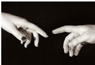
challenge (basic): Touch score: 5.313 - place: 85/283

I liked this one, voters didn't. Climbed up onto a ladder in my backyard to get the shot. The neighbors think we're lunatics.