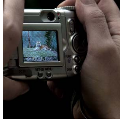
challenge: Off-Centered Subject 2 score: 4.926 – place: 296/356

I love funky eye liner. I need to do more stuff like this ... it's fun for me.