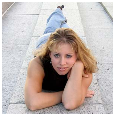
challenge: Color Portrait score: 5.993 – place: 57/284

I have no idea why this one did so bad. There's a whole ad campaign in the US using photos that look exactly like this, but with celebrities. Oh well, I tried.