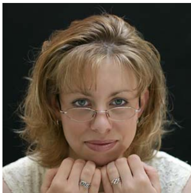
challenge: Color Studio Portrait score: 6.422 - place: 17/92

I like this shot a lot. It's a pretty big crop of the original. I posted the original (full size) and let others photoshop it - what a great job other dpc'ers did on it. I wish I kept their work