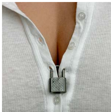
challenge: Dead End score: 5.962 – place: 31/171

This submission is my most frustrating to date. My Rebel was once again in the hands of Canon, so I set out to claim the high score with the powershot A95, and I thought I had it easily. Shows you what I know.