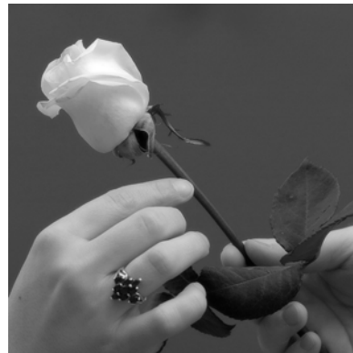
challenge (basic): Romance score: 6.421 – place: 9/129

This picture stinks, it shouldn't have scored anywhere near this high. Sometimes I'm boggled when I see the results of a challenge. The people who placed lower than me have every right to throw a fit.