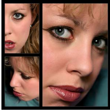
challenge: Triptych score: 6.216 – place: 38/229

I love funky eye liner. I need to do more stuff like this ... it's fun for me.