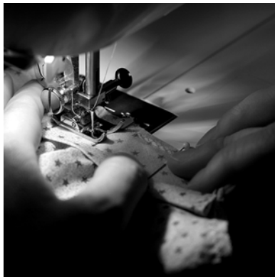
challenge (basic): Single Light Source 2 score: 6.145 – place: 18/282

This is one of my worst entries. It's terrible, the score's terrible, I feel terrible for entering it.